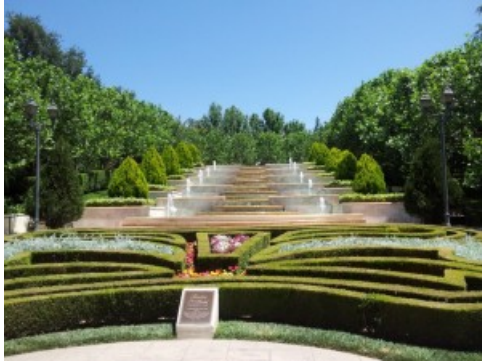
Gardens of the World

Experience a free oasis of floral & botanical beauty located off the 101 freeway in Thousand Oaks, just a 30 minute drive from the San Fernando Valley.